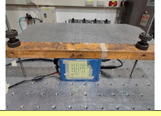
Vibration Test (Z axis)